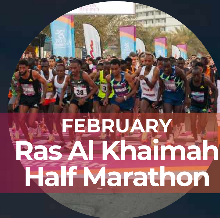
FEBRUARY Ras Al Khaimah Half Marathon