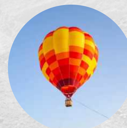
ActionFlight Hot Air Balloon Ride