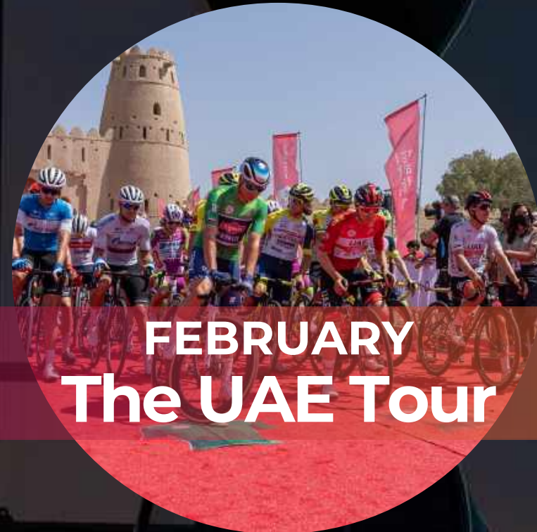
FEBRUARY The UAE Tour