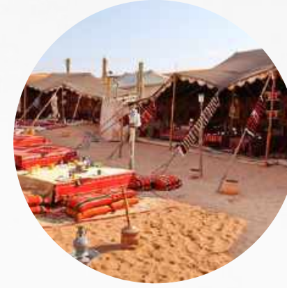
Bassata Desert Village