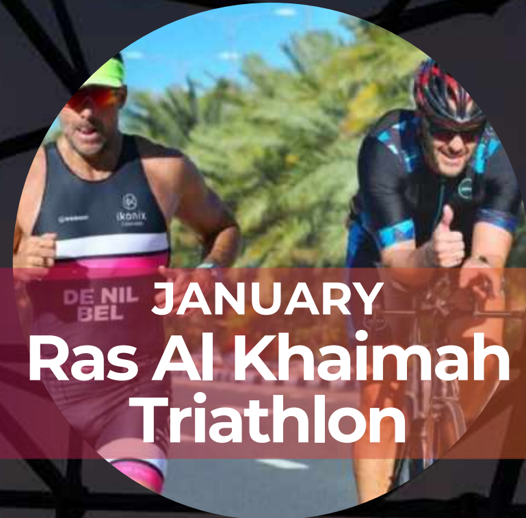
JANUARY Ras Al Khaimah Triathlon