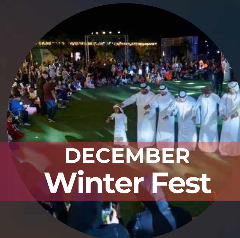
DECEMBER Winter Fest