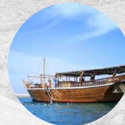
Miss Teak Dhow