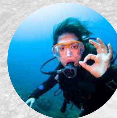
Al Jazeera Diving Centre