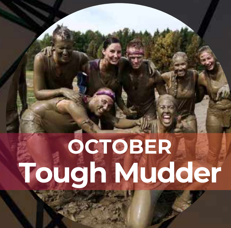
OCTOBER Tough Mudder