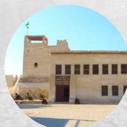
The National Museum