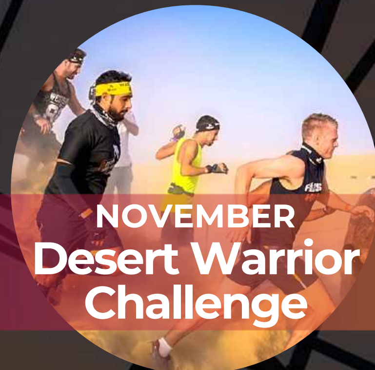
NOVEMBER Desert Warrior Challenge