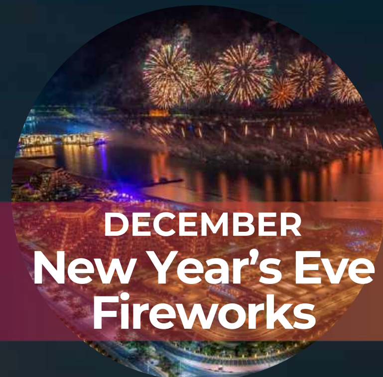
DECEMBER New Year's Eve Fireworks

For more information on the events taking place in Ras Al Khaimah, please visit rakcalendar.ae