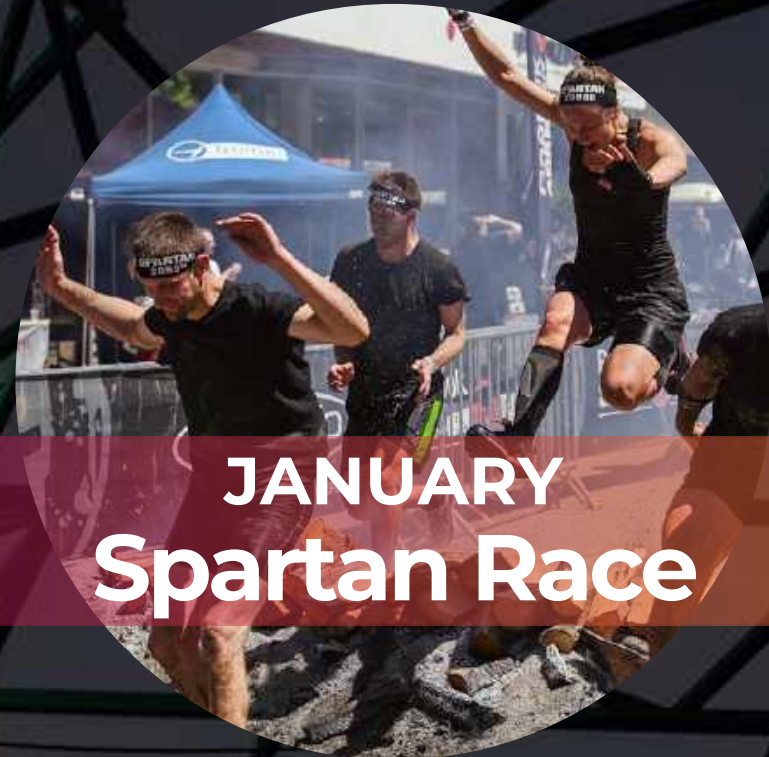
JANUARY Spartan Race