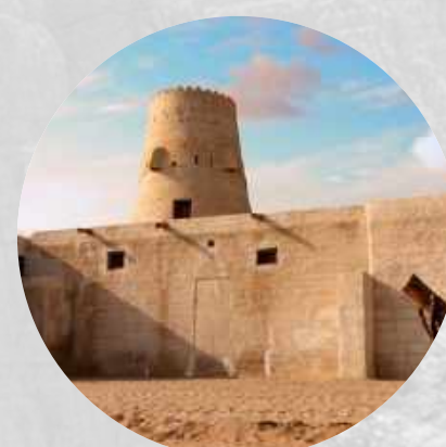
Jazirah Al Hamra