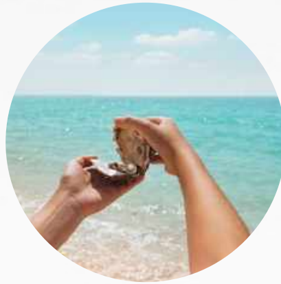
Suwaidi Pearls Farm