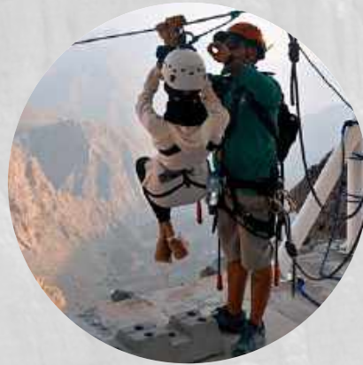
Jais Sky Tour