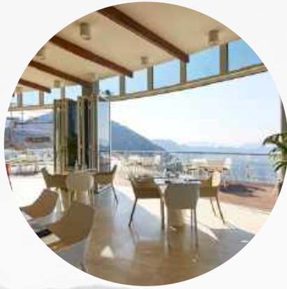
1484 by Puro