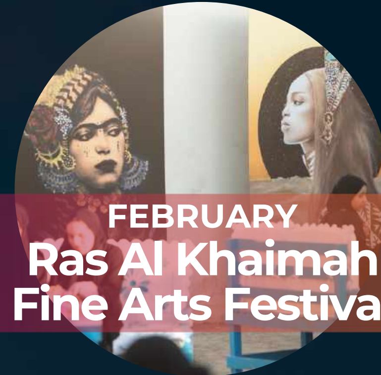
FEBRUARY Ras Al Khaimah Fine Arts Festival