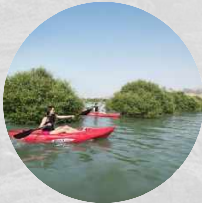
Challenging Adventure Kayaking