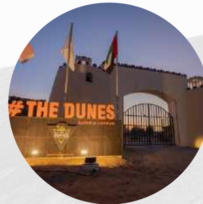
The Dunes Camping